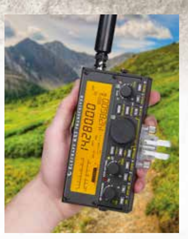
Finally...a full-featured, 10-W, 9-band radio the size of an HT! (Whip antenna not included)

The KX2's powerful 32-bit DSP offers dual watch, stereo audio, user-programmable filter bandwidths, noise blanking, noise reduction, and auto-notch. RTTY and PSK data modes are built in—no PC needed—as well as a memory keyer and digital voice recorder for transmit.