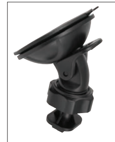
Suction Cup Bracket

The CDR 810 should be mounted to the windshield using the included Suction Cup Mount. Make sure to line the unit up so that it has a clear view of the road. If you are rotating the camera to view the cab, make sure to change the Rotate Setting to ON in the Tools Menu.