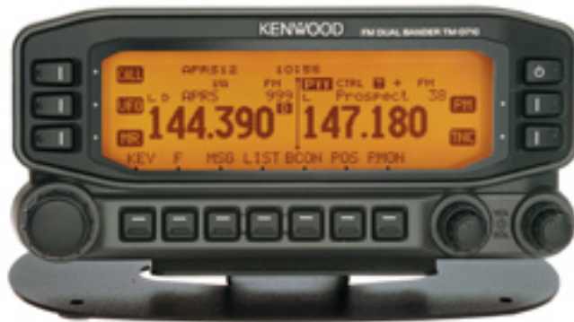
Figure 1 — Here, the TM-D710A's control head is set up for APRS operation on the left side and voice operation on the right.

■ Many 'D700A users send a 100 Hz tone with beacons and set the receiver subaudible tone to 100 Hz on the APRS channel. This opens the squelch so we hear beacon packet