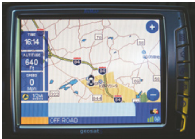
Figure 2 — The G5's map shows APRS station data received from the Kenwood TM-D710A near the center of the display. The blue area near the bottom of the screen is for location and driving directions when the vehicle is in motion.

While hams naturally focus on the APRS features, the G5 was designed for the personal navigation marketplace. It offers turn-by-turn driving directions and options such as fastest or shortest route. A line at the bottom of the display spells out your current location, and another tells you the street to take at the next maneuver. Next to that, a graphic depicts the maneuver