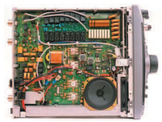
Top view with covers removed showing PAs, filters and ATU.

On HF and 6m, a front panel pushbutton selects between two antenna sockets, the setting being stored with the band stores. Also on these bands a separate receive antenna may be used such as a loop or a Beverage although switching is via the user menu set-up. An auto ATU is built-in matching up to 3:1 VSWR and covers all bands including 6m. A 'T' network is used with relays switching capacitor and inductor values in binary sequence to implement a compact and fast tuning ATU. 22 preset tuning settings are stored giving one to three settings per band. Separate antenna sockets are provided for 2m, 70cm and 23cm (when fitted). Separate linear switching and control is provided for HF, 6m, 2m, 70cm and 23cm with selectable delays to accommodate fast or slow switching amplifiers.