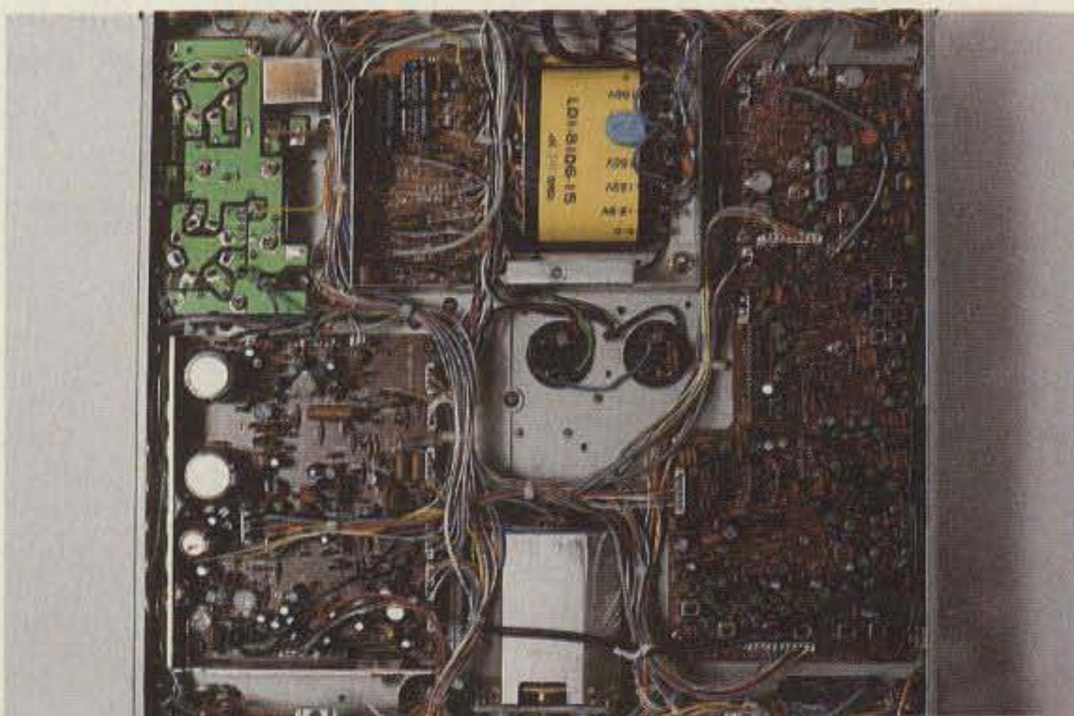
Bottom view of the TS-530S.