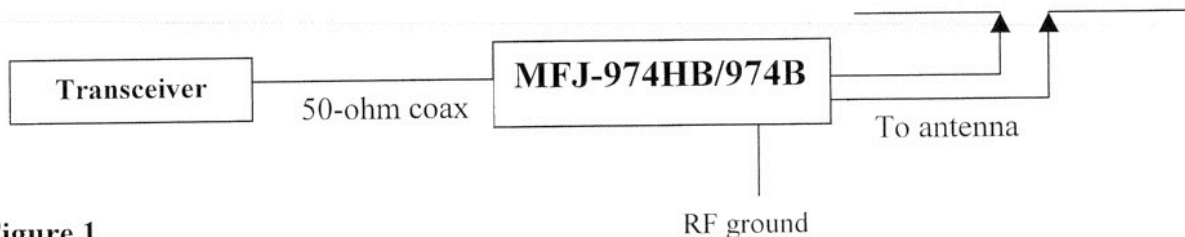
Figure 1 Block Diagram