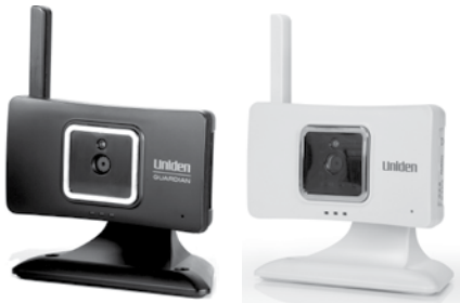
GC43 or GC43W (White) camera (1)